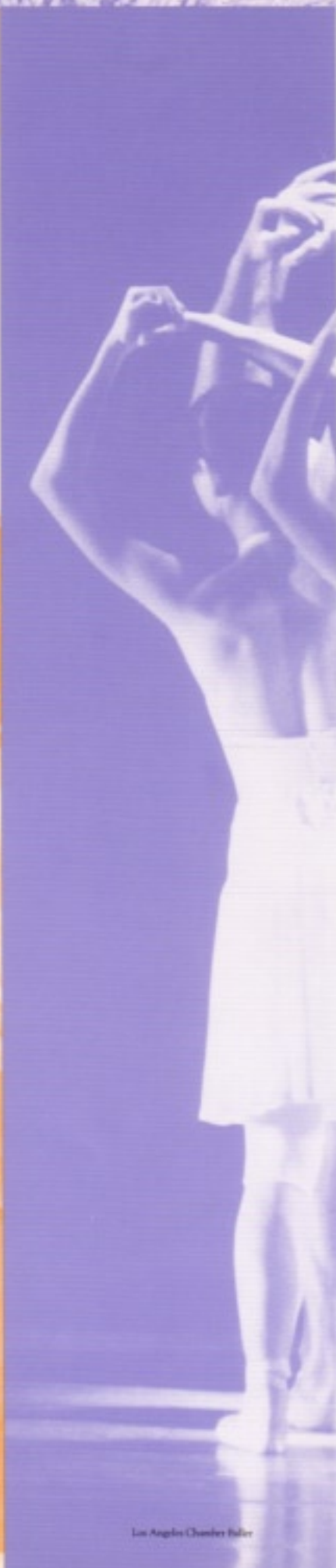
Los Angeles Chamber Ballet