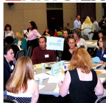
Lots of information and resources for both individual artists and small budget organizations!

REGISTER ONLINE through SurveyMonkey by visiting this website: