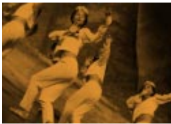
Ney Nava Dance Theatre performs authentic Persian dances.

In March 2001, the Commission added a new program to serve the needs of folk and traditional artists in Los Angeles County, the most diverse community in the nation, and to share these traditions with the public.