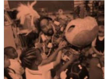
Public Corporation for the Arts sends artists, such as this Afrikan Cultural Center storyteller, into the community.