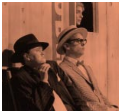
A Noise Within