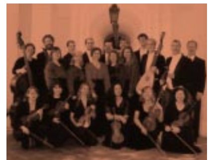
Musica Angelica Baroque Orchestra (Apollo Amused)