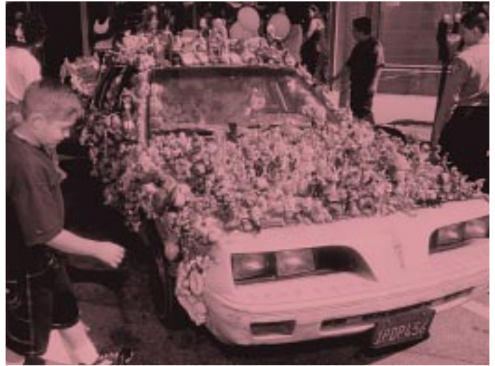
Art Car Exhibition at Inglewood's Open House site

The Commission is grateful to the hundreds of arts organizations, individual artists and facilities who have helped make Arts Open House a true reflection of the arts in Los Angeles. All Los Angeles-based arts organizations are invited to participate in Arts Open House. Participation forms are available in April and due in June for the following October.