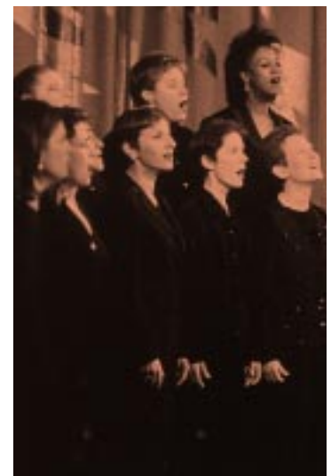
Vox Femina Los Angeles