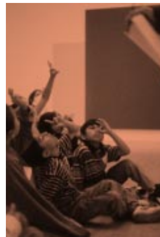
Children visiting the Museum of Contemporary Art.

The Organizational Grant Program for large budget organizations provides annual support for projects designed to increase the accessibility of the arts for Los Angeles County residents. Organizations awarded in this category include major Los Angeles County institutions. In 2000, a minimum grant award of $15,000 was established.