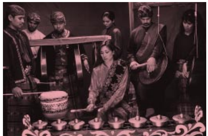
World Kulintang Institute