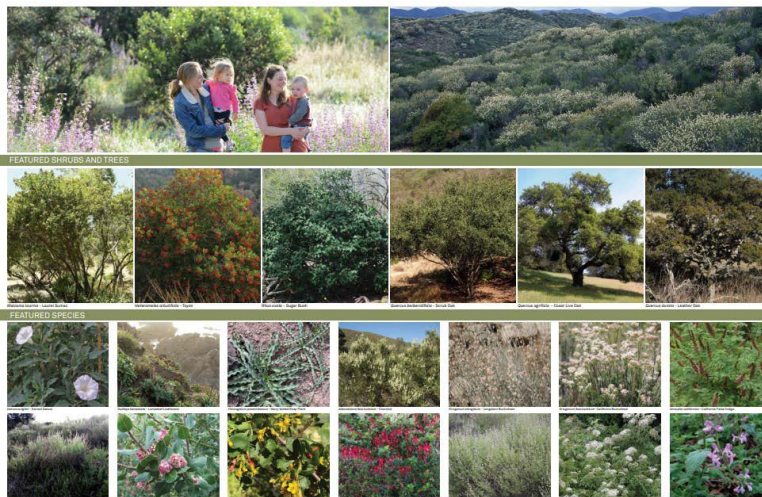
Puente Hills Landfill Park will include a diverse array of native plants

2016 Master Plan – Puente Hills Landfill Park