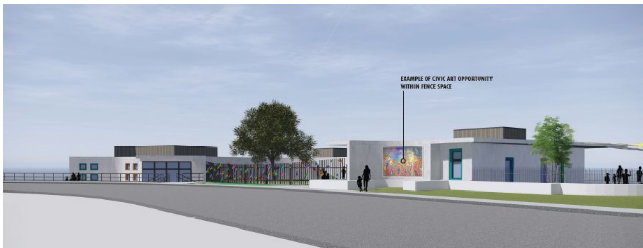
Fig 1, Child Care Center with Exterior Mural

The Los Angeles County Department of Arts and Culture (“Arts and Culture”) Civic Art Division seeks an Artist or Artist team to create a permanent mosaic mural for the exterior of the LAC+USC Child Care Center in Los Angeles. In this Call for Artists, Department is requesting qualifications for inclusion in the Child Care Center’s civic art selection process.