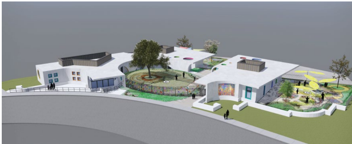
Fig 3, Child Care Center with Mural Wall of State Street

The artwork is located on State Street, opposite the main entrance to the CCC within a small benched-in area where families can meet before or after pick-up and staff can break for lunch. LAC+USC visitors driving on State Street will encounter the mural on their way to Zonal Avenue. Community members will also regularly pass the artwork walking to the LAC+USC Wellness Center from the West.