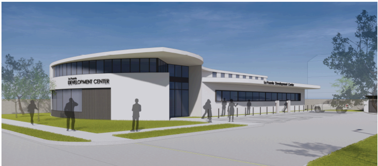
Fig 1, La Puente One Stop Center with Exterior Mural

Apply Online: https://apply-lacdac.smapply.io/prog/la_puente_one_stop_development_center/