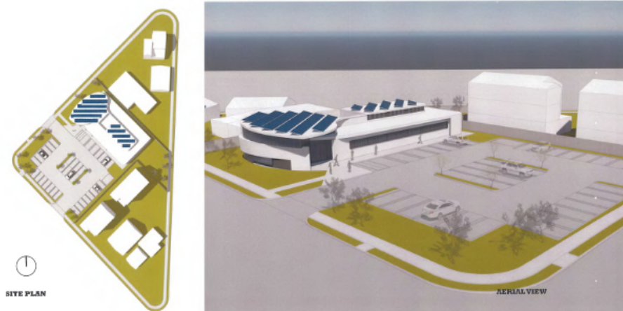
Fig 2, Aerial view and site plan of the La Puente One Stop Development Center.