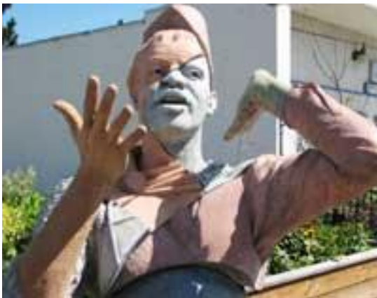
Break-dance statue in a park in the Iron Triangle, Richmond, CA.

In The Iron Triangle Legacy Project, the artists at the East Bay Center for Performing Arts are working with more than 250 residents of the Iron Triangle neighborhood of Richmond, Calif., one of the most dangerous cities in the U.S. The East Bay Center's neighborhood suffers 42 percent of the city's violent crime and most of its murders. But the area also has a rich cultural life and a colorful historic past. Locals feel their neighborhood story has been told too many times by others. They want to define their own community values and identity, and shift perceptions of their community by telling