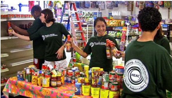
Market Makeovers, Public Matters and Healthy Eating Active Communities

makes my neighborhood look better. This market makeover built a sense of community pride. You can't put a price on that."