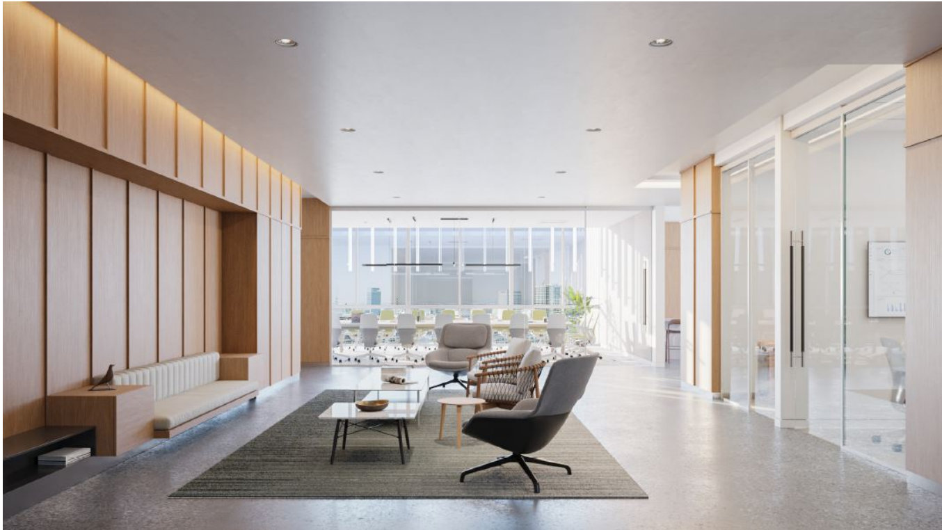
Art Location: Flex Space (lobby), Hall of Records - Regional Planning 13 th Floor

Apply online: https://apply-lacdac.smapply.io/prog/hall_of_records_-_regional_planning_13th_floor/